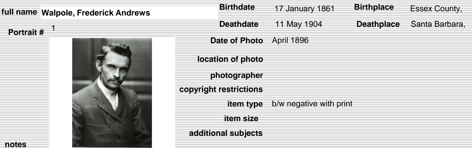
Photo probably taken in Washington, D.C. - see letter from Burkhart dated Oct. 27, 1970 in Walpole's biog. folder. Neg: 4 x 5. On HI web site, as of Jan. 2006.